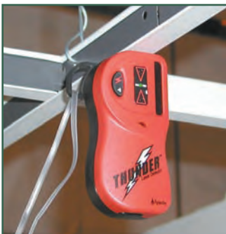
Exterior Model 54 - Includes Rod Clamp