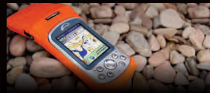
Archer plus Hemisphere GPS XF101 Receiver

Copyright 09/09 Juniper Systems, Inc. Specifications are subject to change without notice. Juniper Systems, the Juniper Systems logo, and Archer Field PC are registered trademarks of Juniper Systems, Inc. Bluetooth is a registered trademark of the Bluetooth SIG, Inc. All other trademarks are registered or recognized by their respective owners.