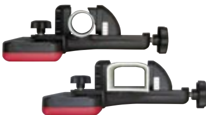
Model 43 Clamp